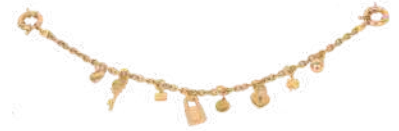
Lucky Charm chain